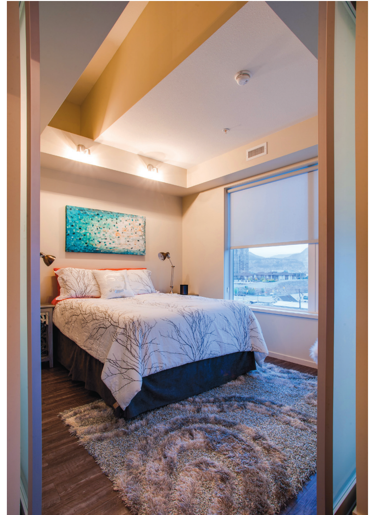
Feature bulkheads in master bedroom at Sole Kelowna, a new construction multifamily project