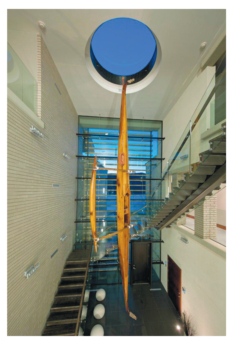
Aberdeen Hall High School Vision Hall with 40' high suspended wood ceiling installation